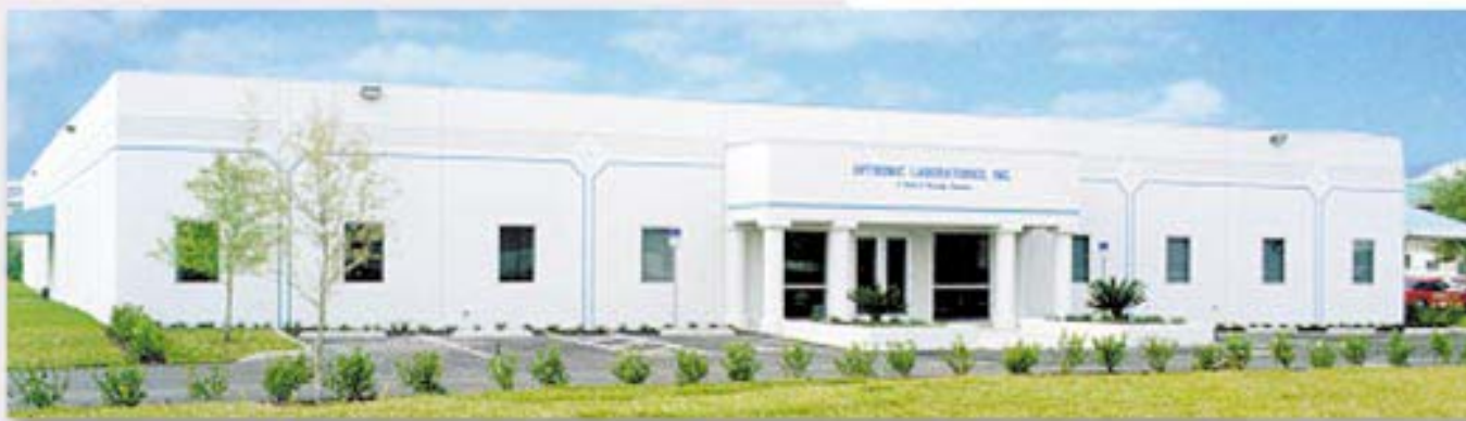
OPTRONIC LABORATORIES, INC. HEADQUARTERS • Orlando, Florida