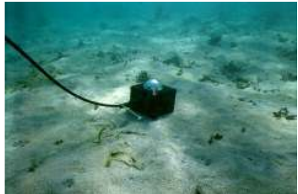
A submerged OL IS-470-WP connected via OL 730-7Q-WP waterproof fiber optic to an OL 756 Portable Spectroradiometer on the surface.

The OL IS-470-WP Submersible Sphere Assembly is a sealed, 4-inch diameter integrating sphere suitable for underwater measurements up to a depth of 20 meters. The sphere uses a dual port design with a 90° port configuration, and contains an internal baffle before the exit port to permit only integrated light from exiting the sphere. Optical delivery to the OL 756 Optics Head is via an OL 730-7Q-WP Waterproof Fiber Optic Probe. The OL IS-470-WP and OL 730-7Q-WP assembly are usable over the 280nm to 1100nm wavelength range. The operating temperature range is -5°C (non-submersed) / 10°C (submersed) to 50°C.