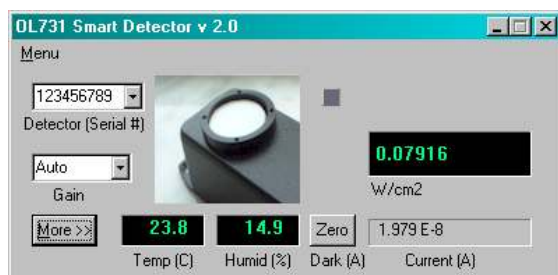
Figure 2 – Panel Application with Graphical User Interface

OL 731-SDK Software Development Kit (included) – The Windows XP compatible software development kit allows the user to develop custom applications for the OL731 USB Smart Detector. The software development kit (SDK) provides for high-level control of the instrument. It includes a simple demonstration program and a functional interface for the development of your own custom instrument-control application. The kit is comprised of a panel application with graphical user interface, an ActiveX control, example C++ source code. The ActiveX control functions as an OL731 instrument driver, layered between custom application software, such as the example C++ based panel application, and Windows platform SDK dll's. Source code for the Panel Application is provided as an example for developing your custom client program.